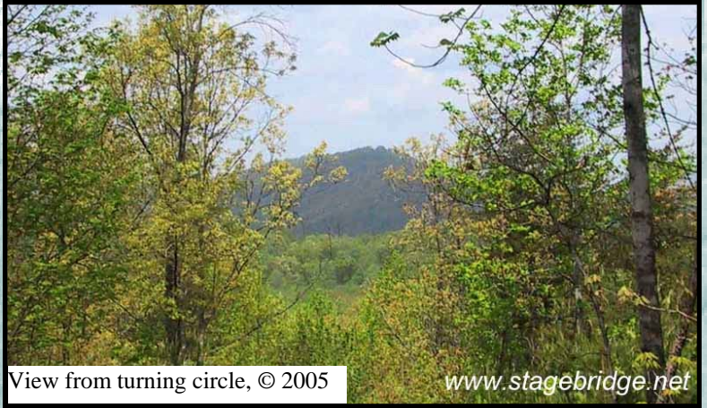
View from turning circle