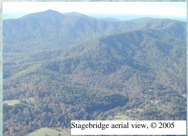
Stagebridge aerial view, © 2005

Stagebridge is located at the intersection of Stagebridge Trail and Stagebridge Road (Nelson Co Rt. 623), five miles north of Lovingson, VA