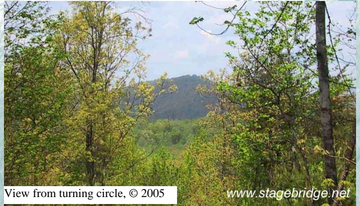
View from turning circle, © 2005